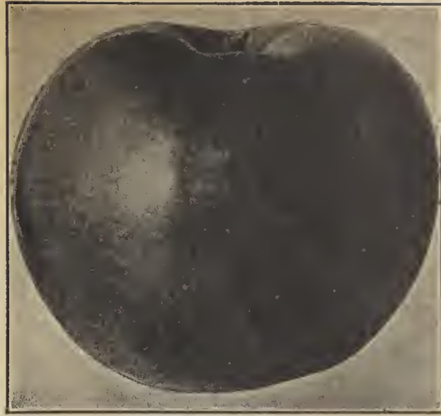
One of few apples ever to be honored with a U. S. Patent. U. S. Patent No. 125